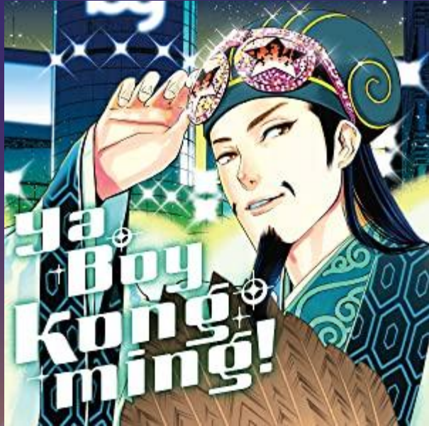
Ya Boy Kongming! (HiDive)